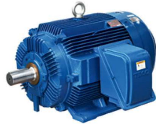
TECO MAXe3 PREMIUM SEVERE DUTY HIGH EFFICIENCY MOTORS